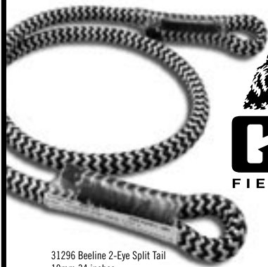
31296 Beeline 2-Eye Split Tail 10mm 34 inches